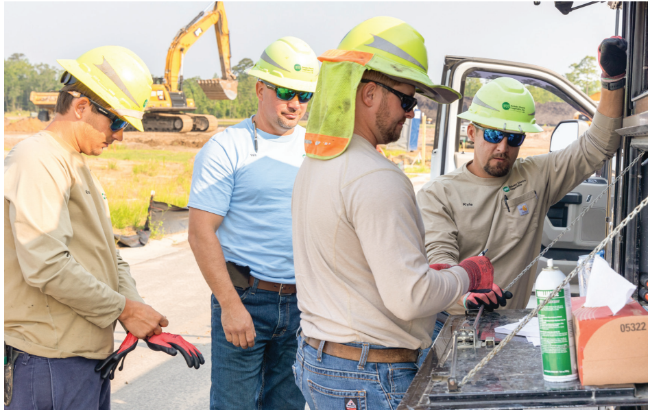
Each job always starts with a tailgate meeting to discuss the scope of the job and safety procedures.

The pond is filled in. Now when Freeman arrives nearby in a truck he and the crew can only dive into their work. But first, there is a tailgate discussion about the job and their objective. On this day, they're installing underground transformers at each vacant lot and connecting them to the existing circuit so that power is available when construction on the houses begins. For Mills, those important objectives are that every connection is correct and labeled.