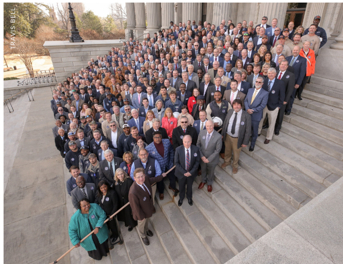
Co-op employees from across the state visited with legislators to thank them for their support and remind them of what is important to our members during Co-op Day at the State House