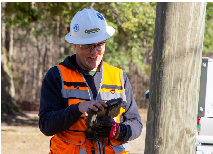
Contractors from Osmose Utilities Services are currently inspecting poles across the Goose Creek district. These behind-the-scenes inspections increase reliability for members.

Some poles can be treated with a preservative sealant wrap to prolong its life and save members money. The co-op